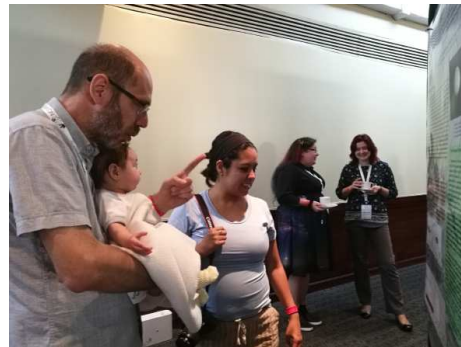
Participants at work.