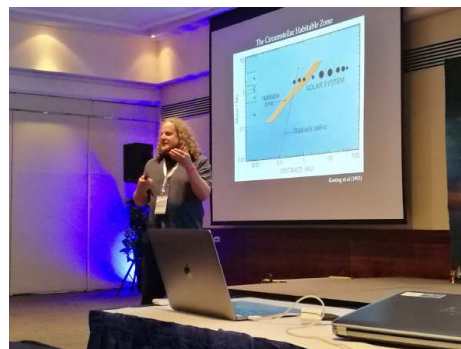
Participants at work.