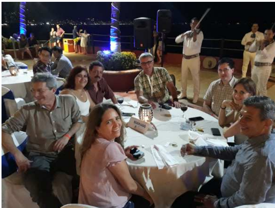
Participants at work and at dinner.