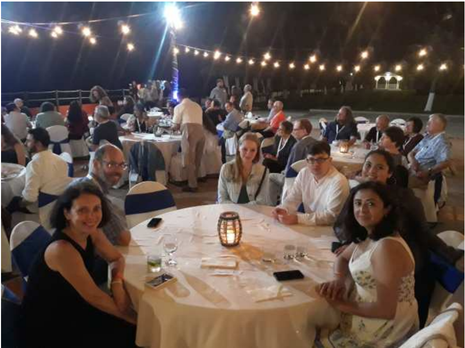
Participants at dinner.