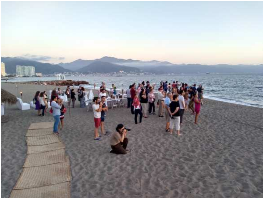
Waiting for the green flash.