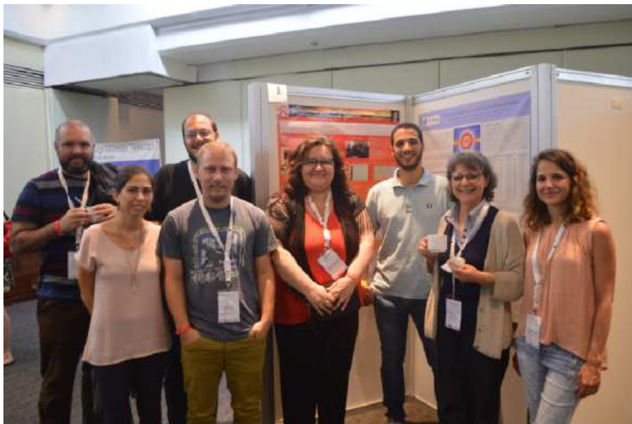
Participants at work.